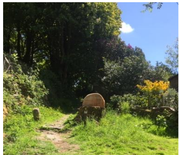
The tree stump seat