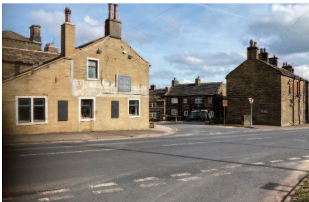
The Duke of York and the Stone Chair

(There are bus services to Halifax and Bradford near here)