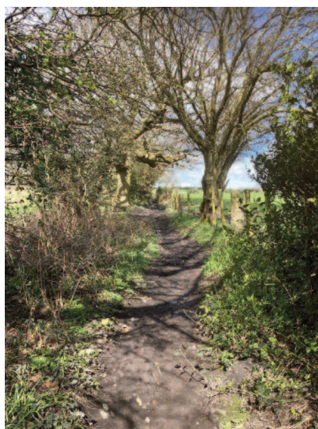
The path before Ox Heys Farm