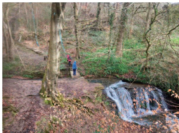
The falls below Dean House Farm