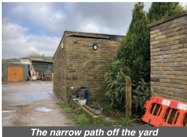
The narrow path off the yard