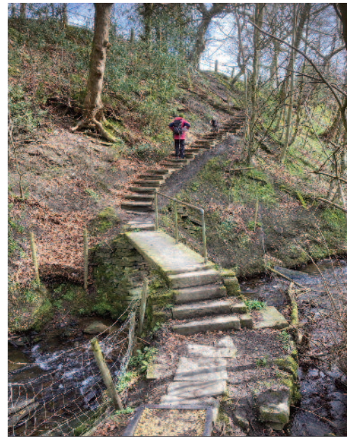
The bridge over Shibden Beck

● Cross the road and immediately turn sharp right onto Swales Moor Road which you follow for about 200 metres. Turn left opposite Slack End to descend a steep concrete track, which winds down hill. About 40 metres after passing an old water trough and just before a layby, turn sharp right on a track running downhill through the woods.