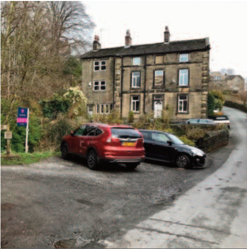
Mill Bank village up the hill, Calderdale Way to the left