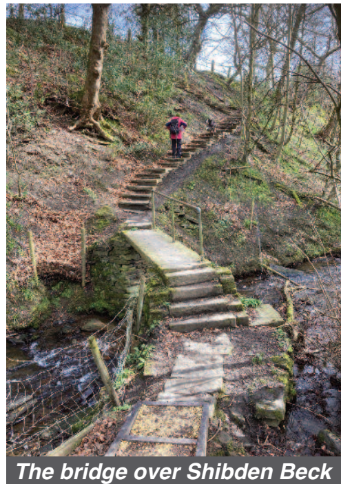
The bridge over Shibden Beck

● Turn left through a metal gate at the junction, following the wall to your right. Keep on the paved path down to Shibden Brook. Cross Shibden Brook by the stone footbridge and follow steps up to the tarmac lane.