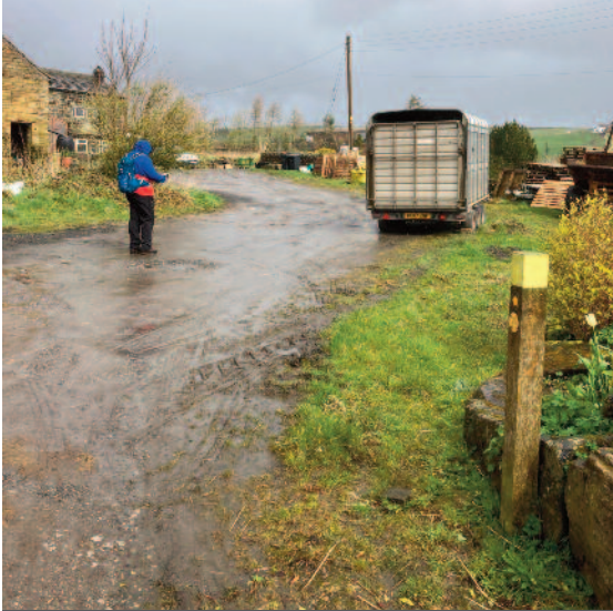
The turning after Moorside Farm

Opposite the farm Link Path K leads to buses at Wainstalls which once had many water-powered mills. All have ceased to operate, though the wheel at Lumb Mill was in use until 1968.